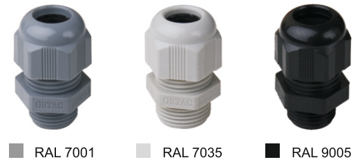
PG THREAD CABLE GLANDS